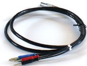
PalmSens4 sensor cable with croc clips, included with standard configuration.