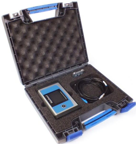
PalmSens4 standard configuration in case with accessories.

PStouch for PalmSens4 will be made available at the end of 2 nd quarter of 2017