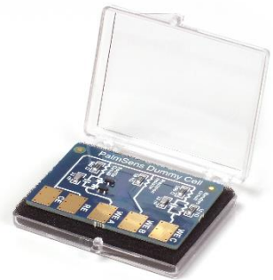
PalmSens Dummy Cell included with standard configuration.